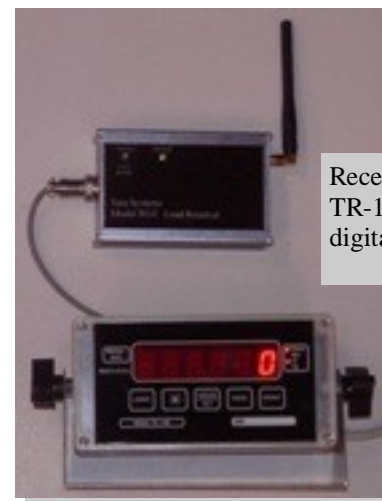
Receiver shown with TR-1-NK digital scale indicator